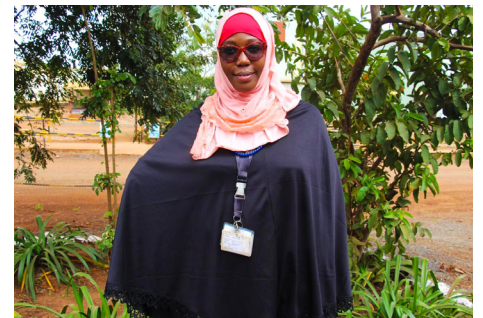
According to Shadya, fear poses a roadblock to success for most, including women.